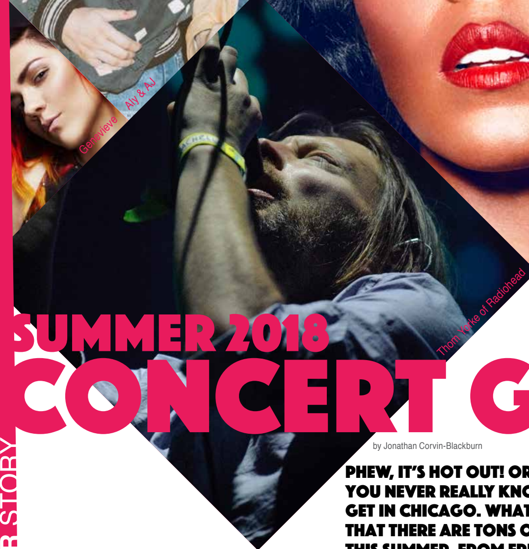
Thom Yorke of Radiohead