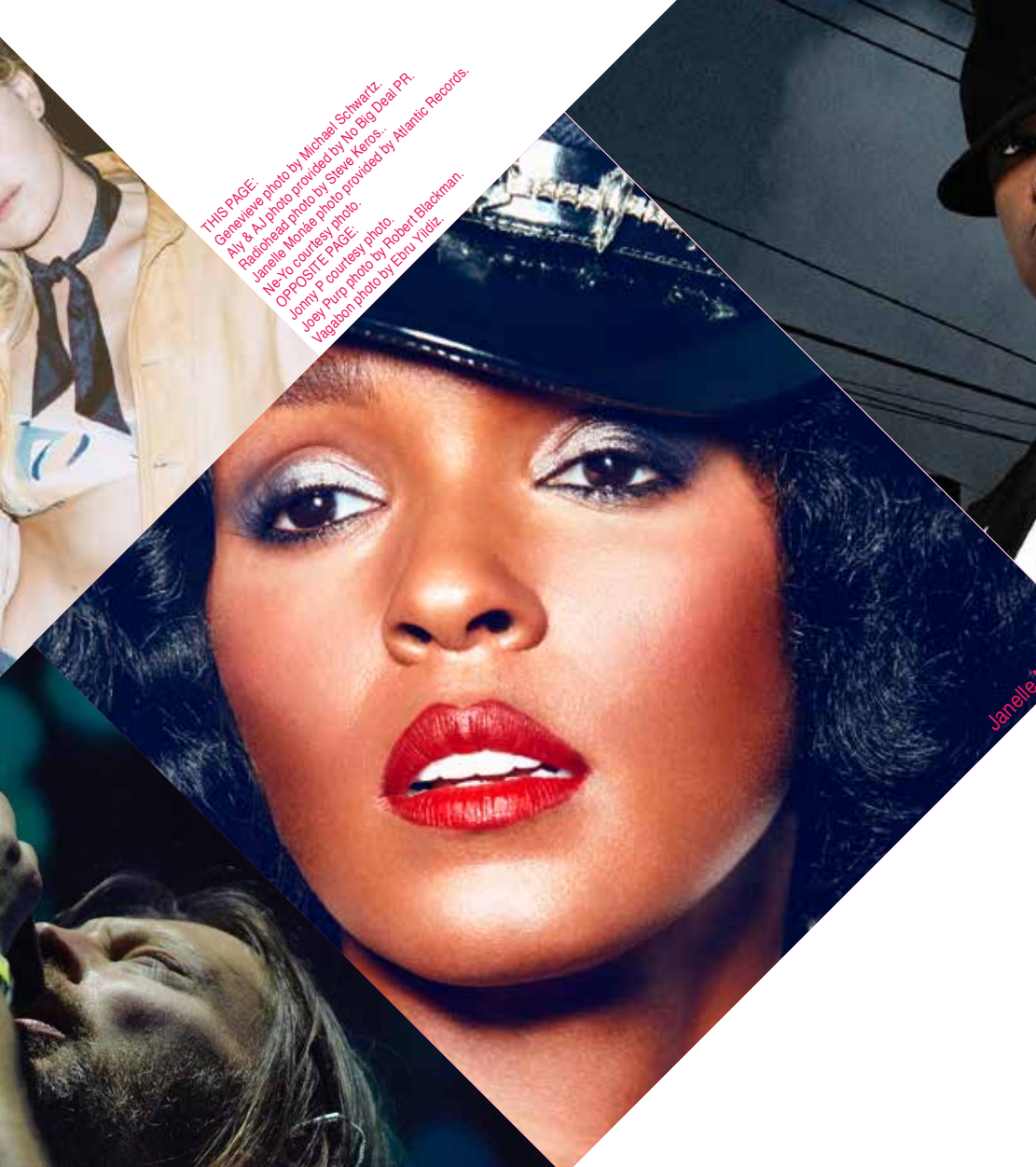
Janelle Monáe Ne-Yo